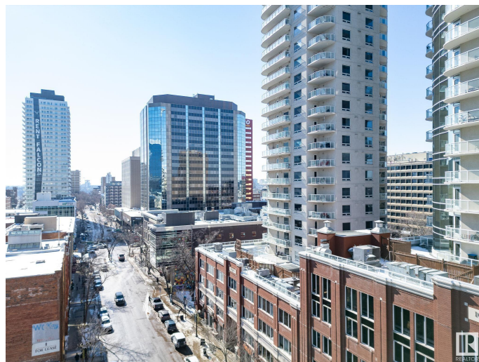
701-10136 104 Street NW, Edmonton, AB