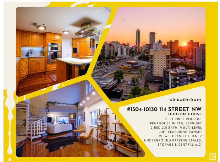
#1504 10130 114 STREET HUDSON HOUSE OLIVER, EDMONTON